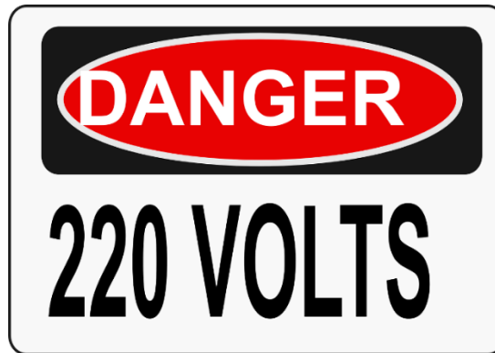
Figure 2 Danger Label - Electrical Hazard