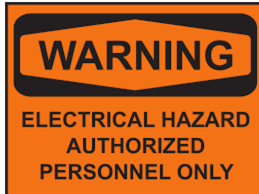
Figure 1 Warning Label - Electrical Hazard

be kept locked. Danger and restricted entry notices shall be provided on the door to warn against unauthorized entry.